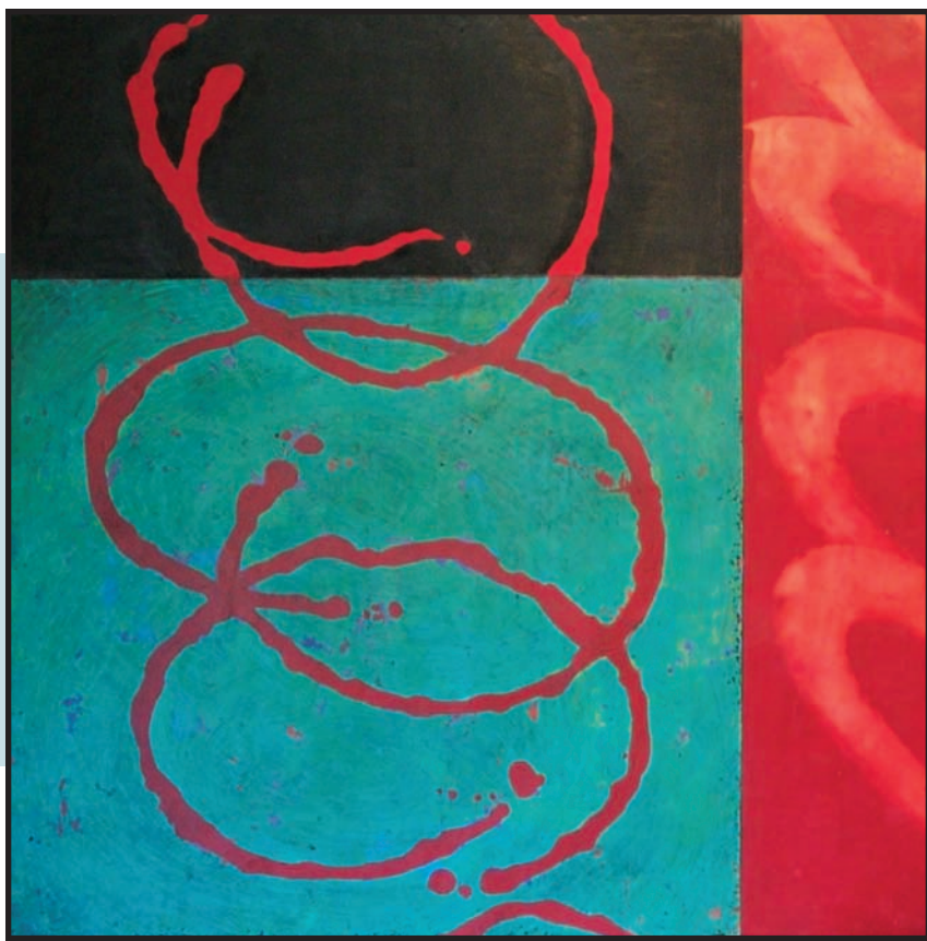
Three Loops , 2008, encaustic on mixed media on panel, 24" x 24"