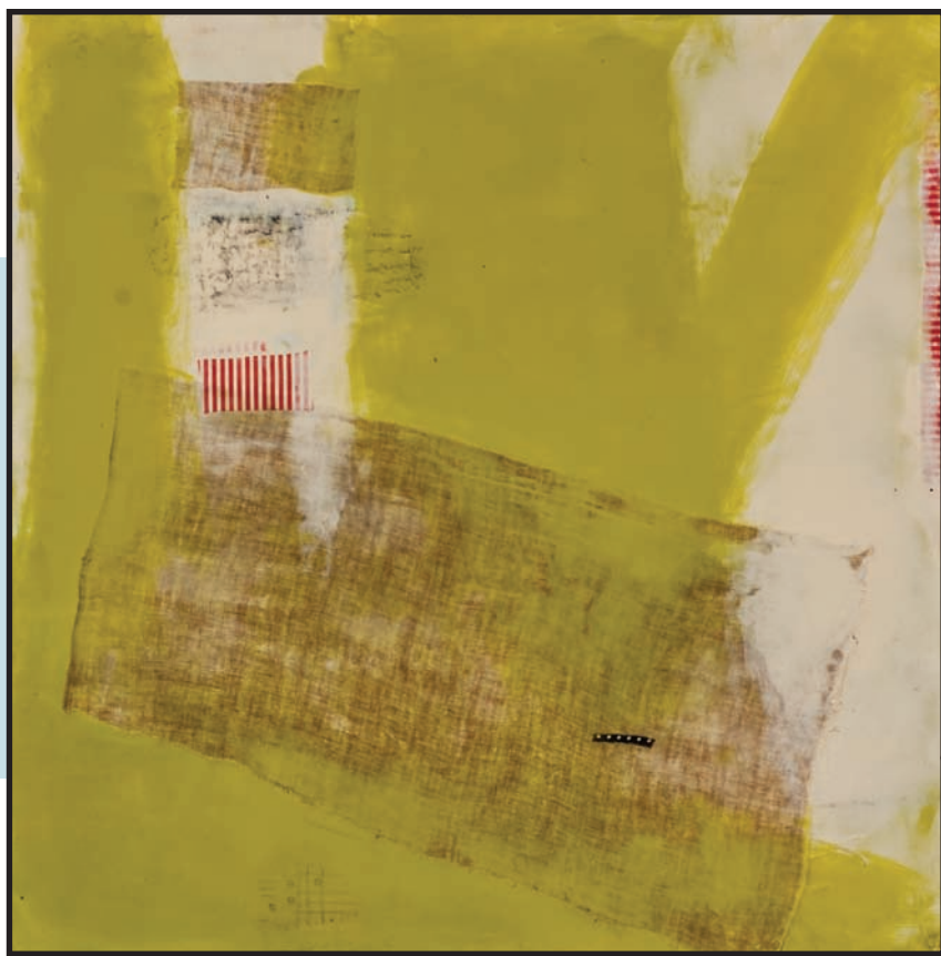
Piece of Maine , 2008, encaustic on panel, 24" x 24"

M. R. Hedstrom grew up in the New York City area. She was immersed in art and music as a child. Hedstrom uses encaustic to achieve a certain surface and color and to express abstract emotional content. Forms that become representational are avoided or destroyed.