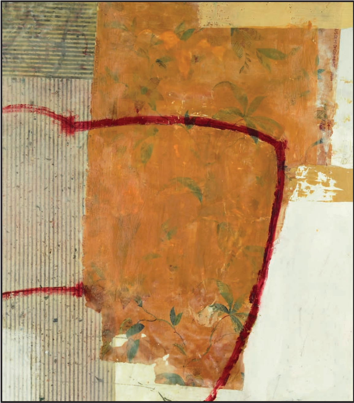
Opposite What , 2006 Encaustic oil mixed media on panel, 34" x 30"