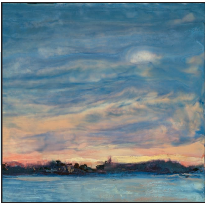
Skyline , 2008, encaustic on panel, 12" x 12"