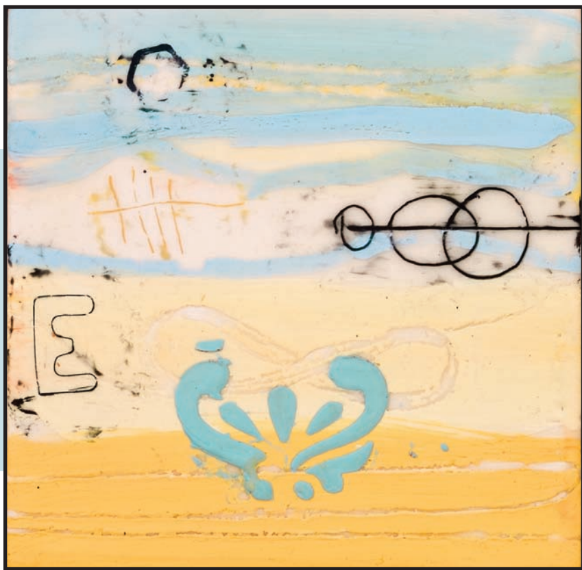
Inspiration , 2007, encaustic on panel, 7" x 7"